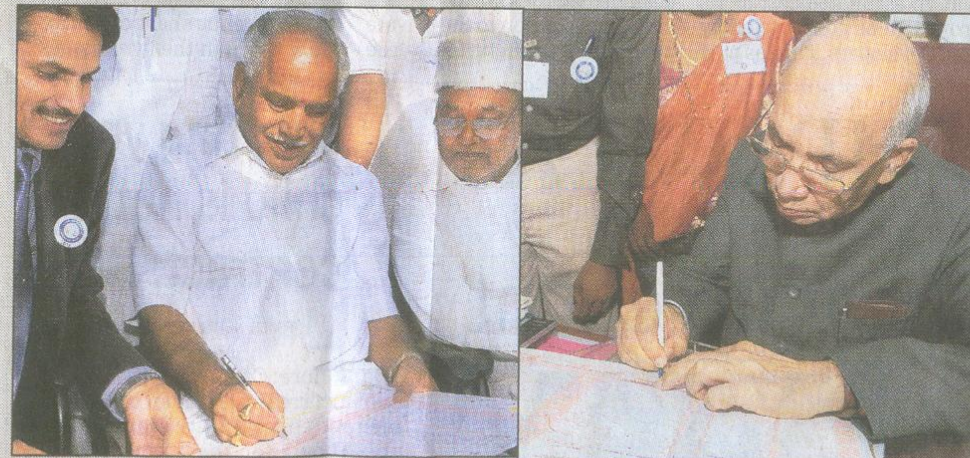
SHOWING THE WAY: Chief minister B S Yeddyurappa and governor H R Bhardwaj take the lead in filling up the census 2011 forms on Thursday

Even by 2 pm, enumerators were still trying to get used to the procedures and the location. Stella (name changed), a schoolteacher posted as an enumerator to one of the enumeration blocks at Shantalanagar ward, was flabbergasted when she was handed over the GIS map of her 'small' block. "It's just empty blocks. Where do I start," was her natural reaction. It took her sometime to understand that she had to fill up the empty blocks with the numbers she marks on the map.